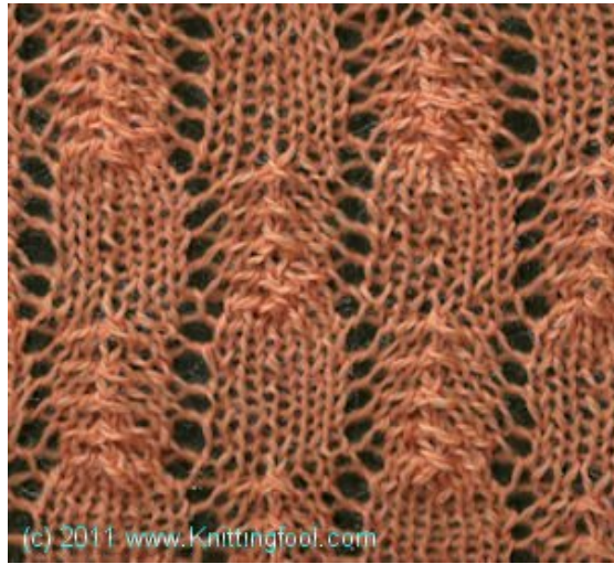
This picture of Fuchsia 2