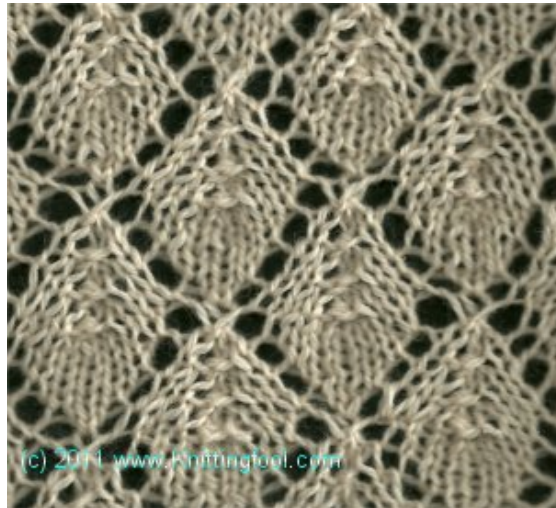
This picture of Acorn 5