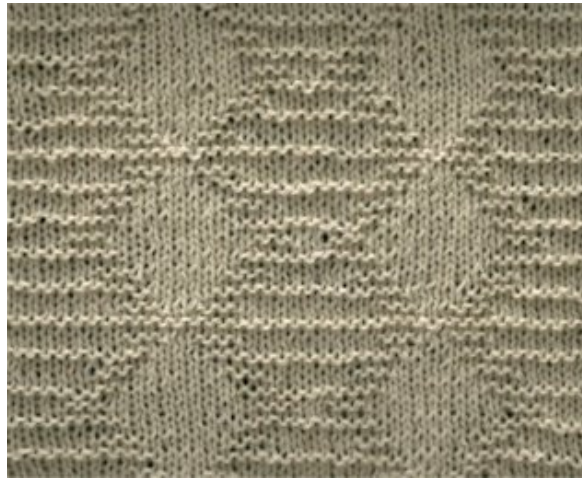
This picture of Ridge Diamonds