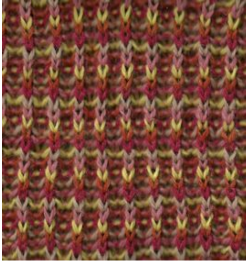
This picture of Five-Color Plain Bioche